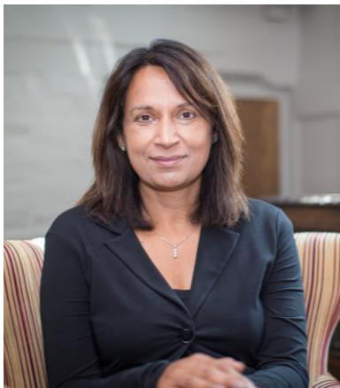
Baroness Ruby McGregor-Smith CBE, author of Race in the workplace: The McGregor-Smith Review 2017 , says:

The Government must make good on its promise following Race in the workplace: The McGregor-Smith Review's recommendations. They must now implement mandatory ethnicity pay gap reporting alongside gender pay gap reporting for employers with more than 250 employees.